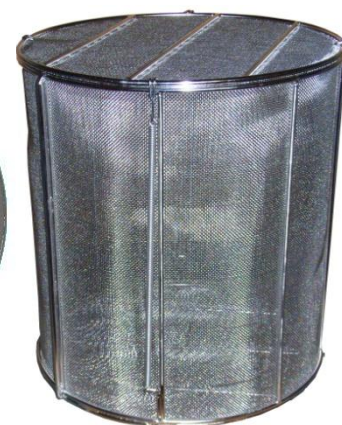
stainless steel basket