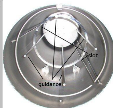
interior view stainless steel drum